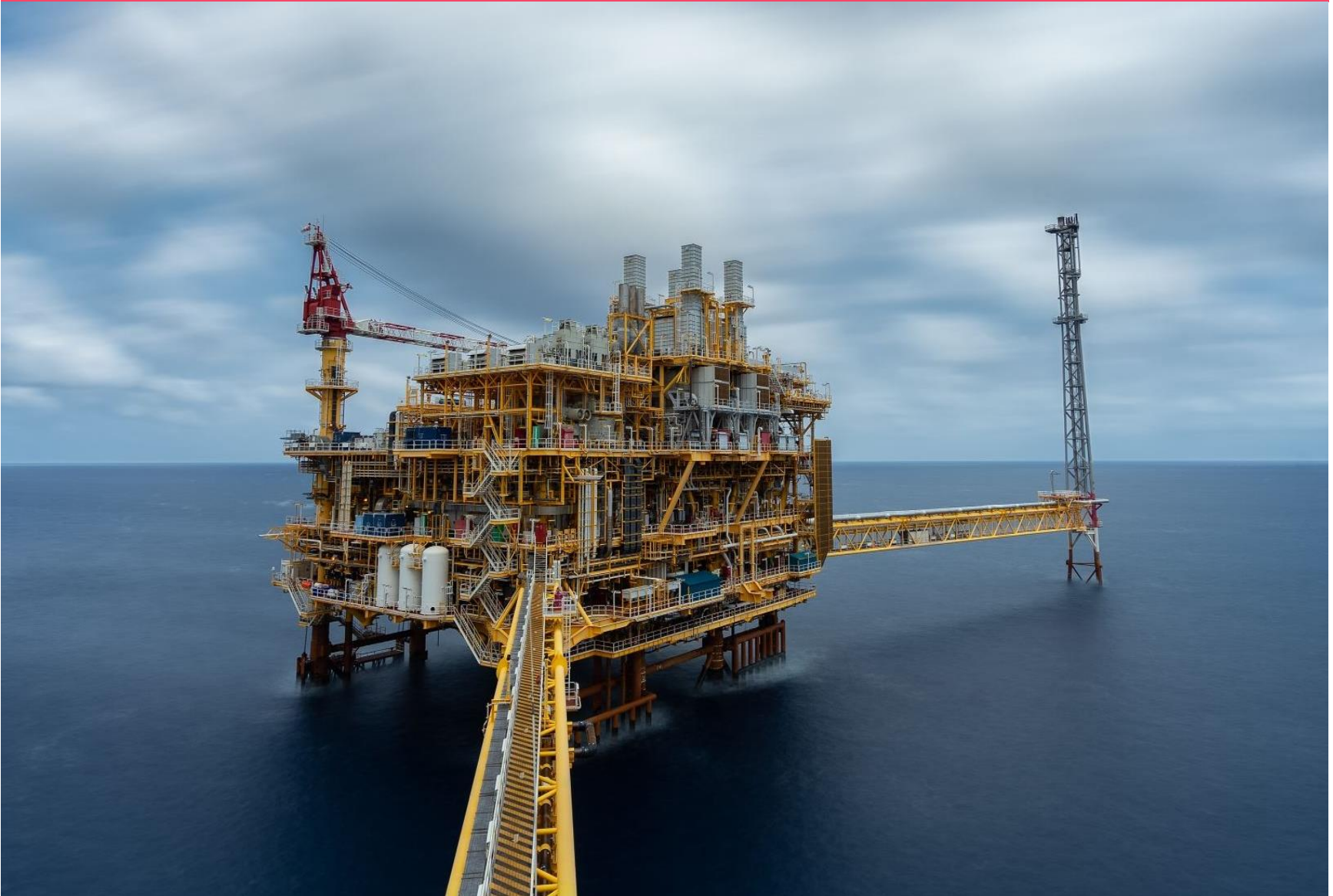
Picture Caption: To make your document look professionally produced, Word provides header, footer, cover page, and text box designs that complement each other.