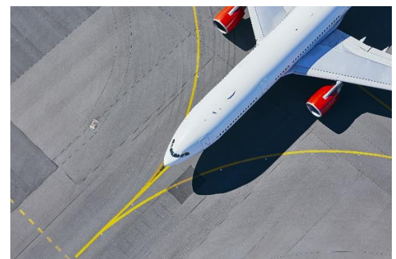
Picture Caption: To make your document look professionally produced, Word provides header, footer, cover page, and text box designs that complement each other.

Video provides a powerful way to help you prove your point. When you click Online Video, you can paste in the embed code for the video you want to add. You can also type a keyword to search online for the video that best fits your document.